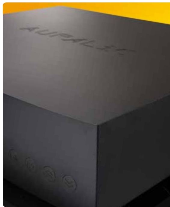
An elegant and modern design in a three-quarter-width chassis

Externally, the Aries G2 is all new. The case is built to a three-quarter-width size and has a new industrial design. It's clean and ultra-modern, but not entirely free of foibles. Auralic has dispensed with the rotary push dial control that is used by the Altair and instead substituted four fixed buttons. These are beautifully recessed into the front panel, but are so dark they are almost invisible even in a well-lit room and the legends are impossible to discern. These are partnered with a 3.97in colour display that shows album art, track title, time and play/pause – but not album title or sample rate – for the file being streamed. The top plate extends over the rear inputs making it look extremely neat, but connecting cables into the socketry and ports from above is harder than it need be. The fit and finish is extremely good, though, and the Aries G2 has the presence and sense of quality that fits with the relatively high asking price. Auralic's Lightning DS control app is another priceless advantage that the